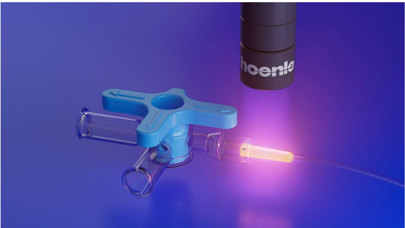
An orange fluorescent UV adhesive that connects the hoses is cured with a Hoenle bluepoint LED.

When developing a new generation of adhesives for the medical technology sector, the primary goal was to ensure that they are well compatible and increase occupational safety. In concrete terms, this meant that these adhesives should be TPO-free (trimethylbenzoyl diphenylphosphine oxide) and CMR-free (carcinogenic, mutagenic, toxic for reproduction). After extensive laboratory tests, it has been possible to develop adhesives with CMR-free raw materials that have the same or higher adhesion strength and elasticity than the original products. Hoenle has thus launched advanced UV adhesives for the production of medical devices on the market, which are also ECHA (European Chemicals Agency) compliant in accordance with the current REACH regulation. These Hoenle adhesives are certified TPO/CMR-free and reduce chemical risks in the workplace and the environment. They are suitable for bonding cannulas, catheters, blood collection sets and diagnostic equipment. These new adhesives meet the biocompatibility test protocols of ISO 10993. For the production of medical wearables, Hoenle Adhesives has developed UV adhesives that are CMR-free and formulated without IBOA. IBOA is an adhesion-promoting monomer that has been linked to cases of skin irritation. IBOA-free adhesives can significantly reduce the health risks for both wearable manufacturers and users.