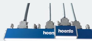
LED Powerline LC