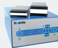
LED Powerline ACIC